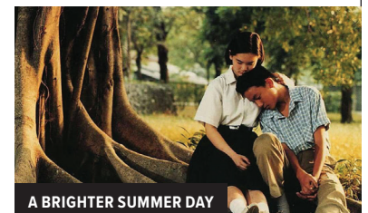
A BRIGHTER SUMMER DAY