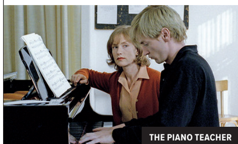
THE PIANO TEACHER