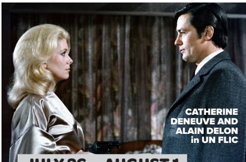
CATHERINE DENEUVE AND ALAIN DELON in UN FLIC