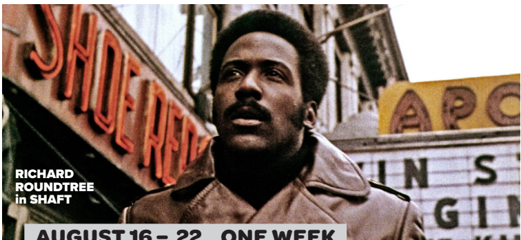
RICHARD ROUNDTREE in SHAFT