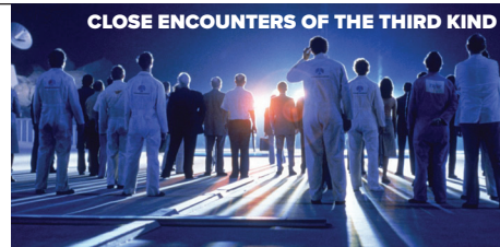
CLOSE ENCOUNTERS OF THE THIRD KIND

19 films, including JAWS | RAIDERS OF THE LOST ARK | E.T. | CLOSE ENCOUNTERS | JURASSIC PARK | SCHINDLER'S LIST | SAVING PVT. RYAN | DUEL THE SUGARLAND EXPRESS (NEW 4K RESTORATION) and much more