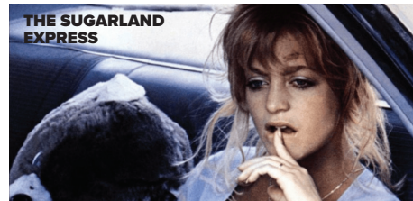
THE SUGARLAND EXPRESS