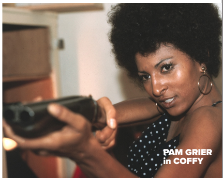
PAM GRIER in COFFY