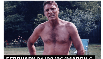
FEBRUARY 21/22/26/MARCH 6

FRI, FEB 21 2:10 SUN, FEB 23 6:00 FRI, FEB 28 6:00