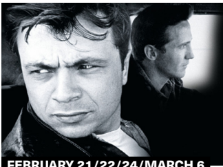
FEBRUARY 21/22/24/MARCH 6

FEBRUARY 21-MARCH 6 • TWO WEEKS OPENING ON THE 100TH ANNIVERSARY OF THE VERY FIRST ISSUE