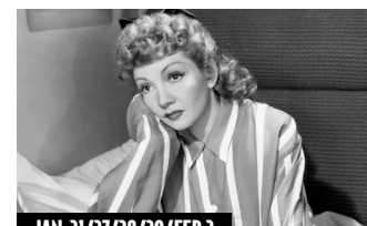
JAN 21/27/28/29/FEB 2

*PRE-RECORDED INTRODUCTION BY STURGES BIOGRAPHER JAMES CURTIS