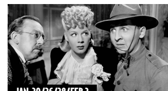
JAN 20/26/28/FEB 2