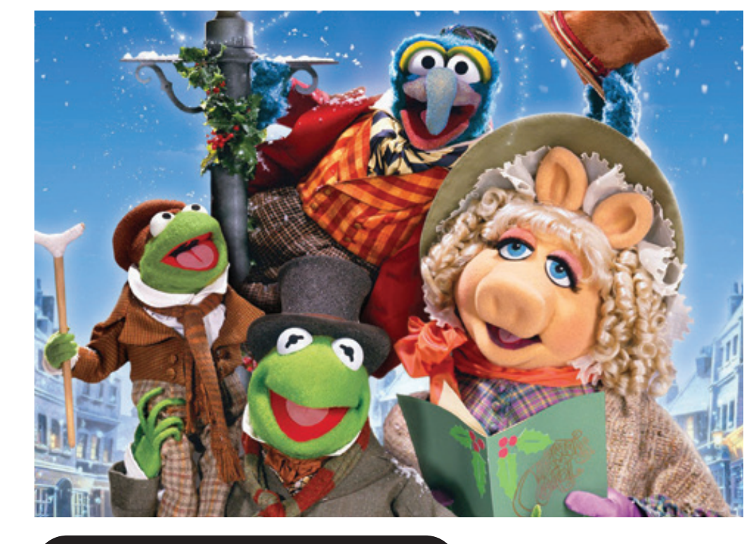
DECEMBER 17 THE MUPPET CHRISTMAS CAROL

SUNDAYS @ 11AM ALL SEATS $13 & $11 (MEMBERS) WINTER 2023-24