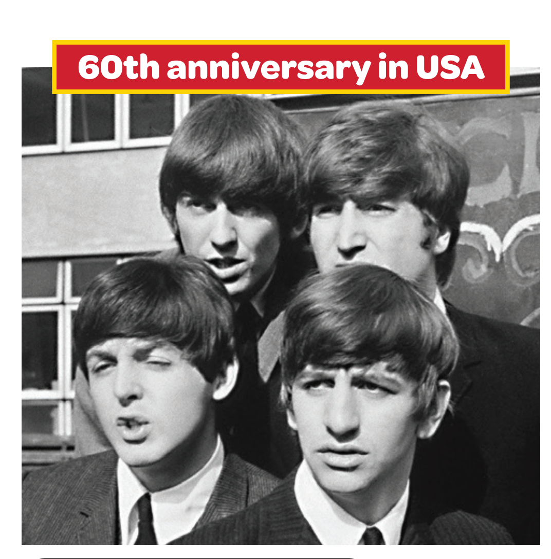
FEBRUARY 7 & 11 The Beatles A HARD DAY'S NIGHT