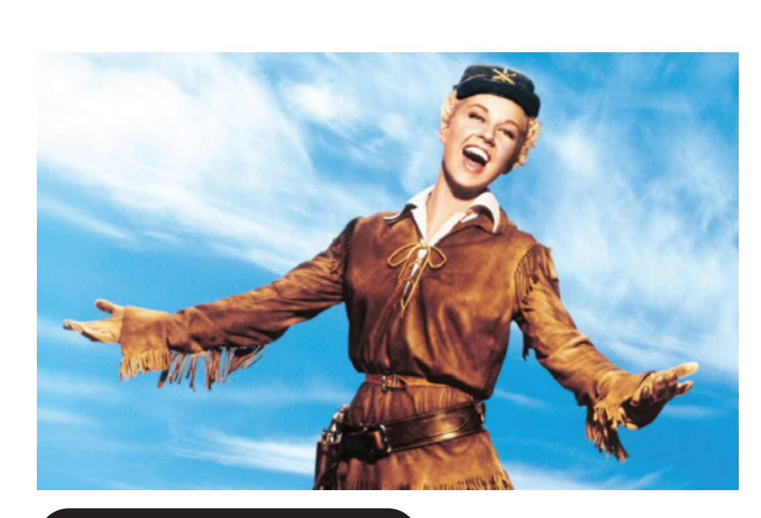
FEBRUARY 4 Doris Day CALAMITY JANE

SUNDAYS @ 11 AM ALL SEATS $13 & $11 (MEMBERS) WINTER 2023-24