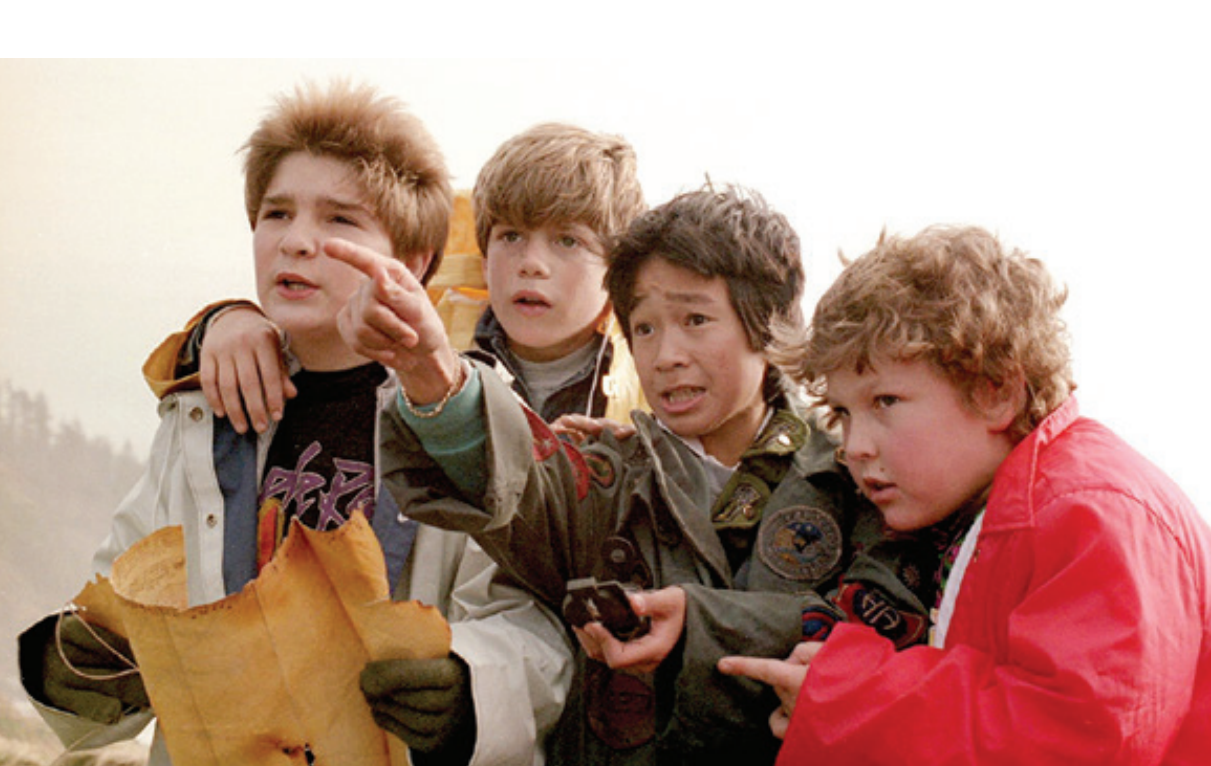
DECEMBER 31 THE GOONIES