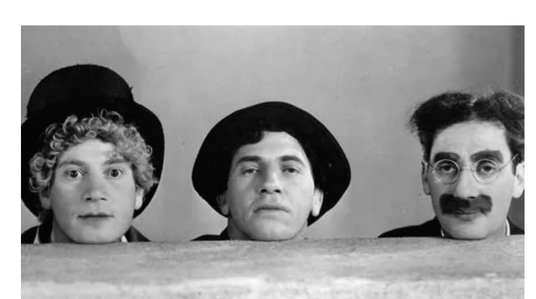
MARCH 3 Marx Brothers HORSE FEATHERS