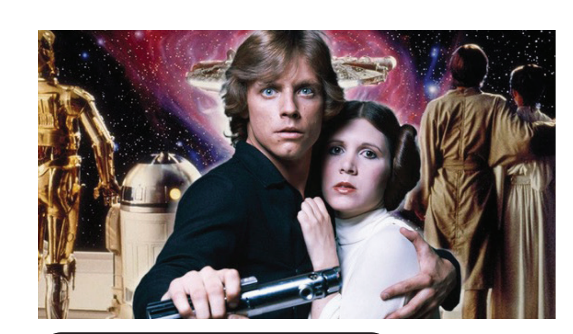
JANUARY 14 & 15 Star Wars: Episode V THE EMPIRE STRIKES BACK