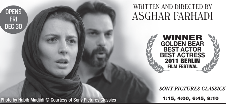
1:15, 4:00, 6:45, 9:10

“ARGUABLY THE MOST BRILLIANT, BRAVE AND INNOVATIVE PERSON WORKING IN HIS FIELD.” – LOS ANGELES TIMES