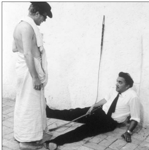
FELLINI: I'M A BORN LIAR