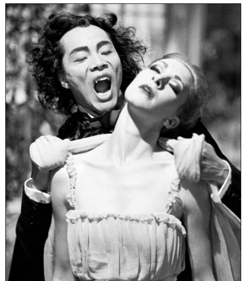
DRACULA: PAGES FROM A VIRGIN'S DIARY