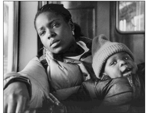
LOVE AND DIANE