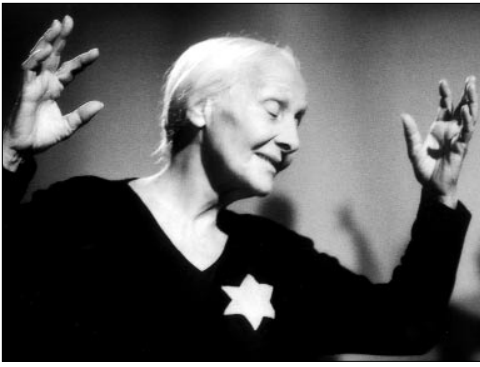
THE LAST LETTER