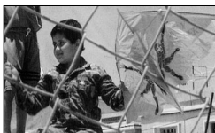
CLOSE, CLOSED, CLOSURE