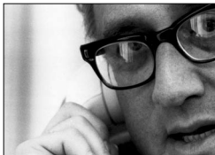
THE TRIALS OF HENRY KISSINGER