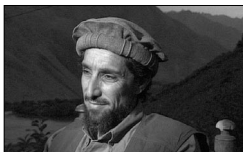
MASSOUD, THE AFGHAN