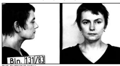
THE BURNING WALL