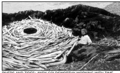
RIVERS AND TIDES: ANDY GOLDSWORTHY WORKING WITH TIME