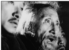
DEVILS ON THE DOORSTEP