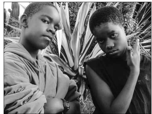
THE BOYS OF BARAKA