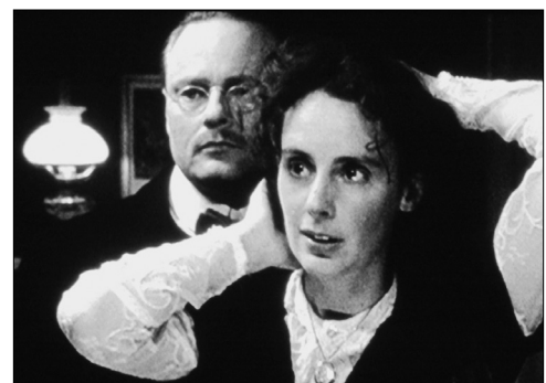
MY NAME WAS SABINA SPIELREIN