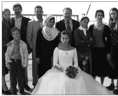
THE SYRIAN BRIDE