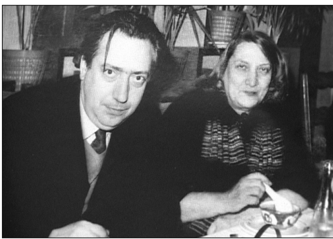
HENRI LANGLOIS: PHANTOM OF THE CINEMATHEQUE