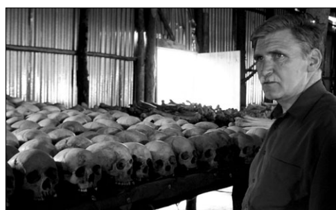
SHAKE HANDS WITH THE DEVIL