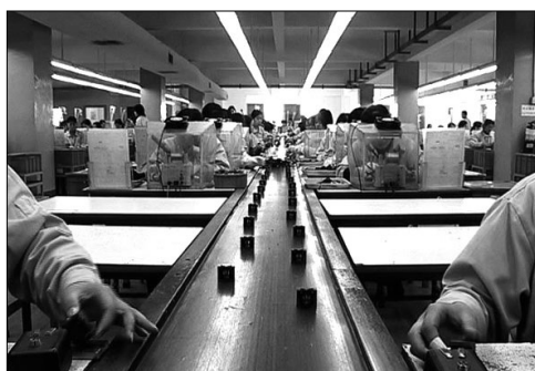
A DECENT FACTORY