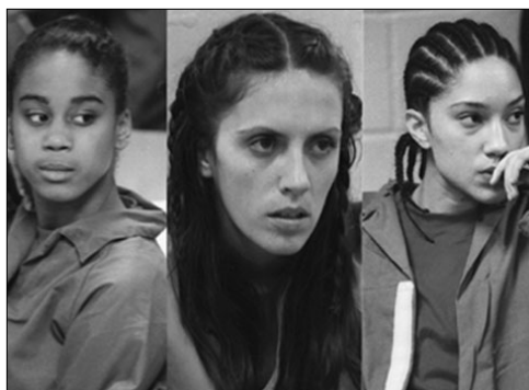
ON THE OUTS