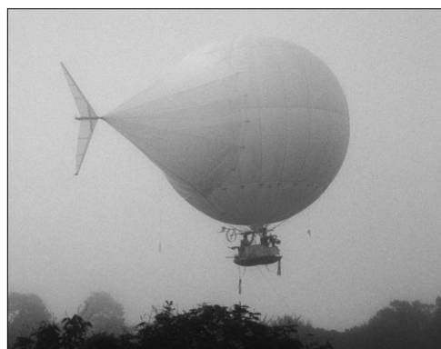
THE WHITE DIAMOND