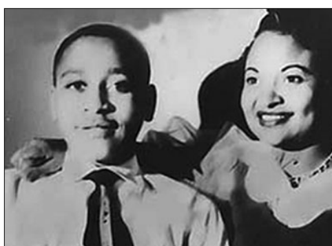
THE UNTOLD STORY OF EMMETT LOUIS TILL