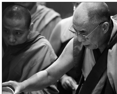
WHEEL OF TIME