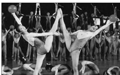
A STATE OF MIND