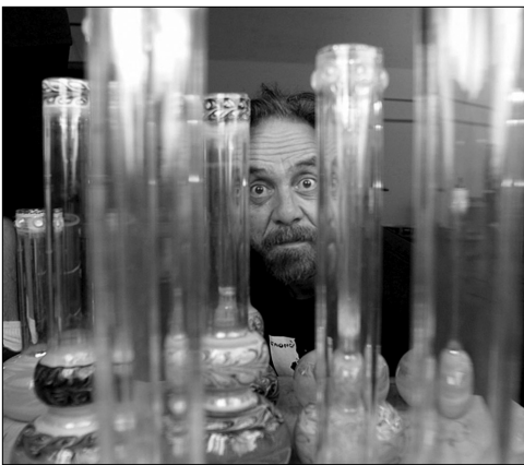
A/K/A TOMMY CHONG