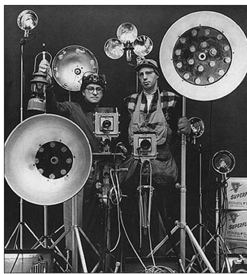
THE PHOTOGRAPHER, HIS WIFE, HER LOVER