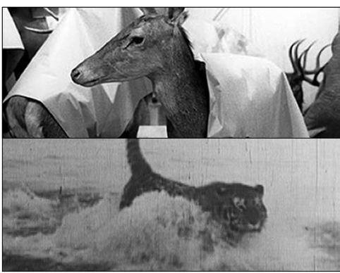
UN ANIMAL, DES ANIMAUX (TOP)