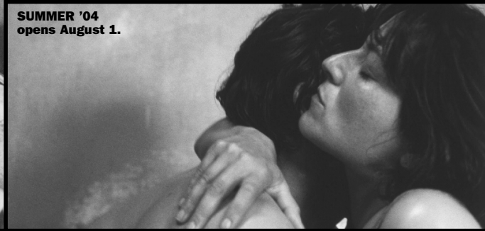
SUMMER '04 opens August 1.