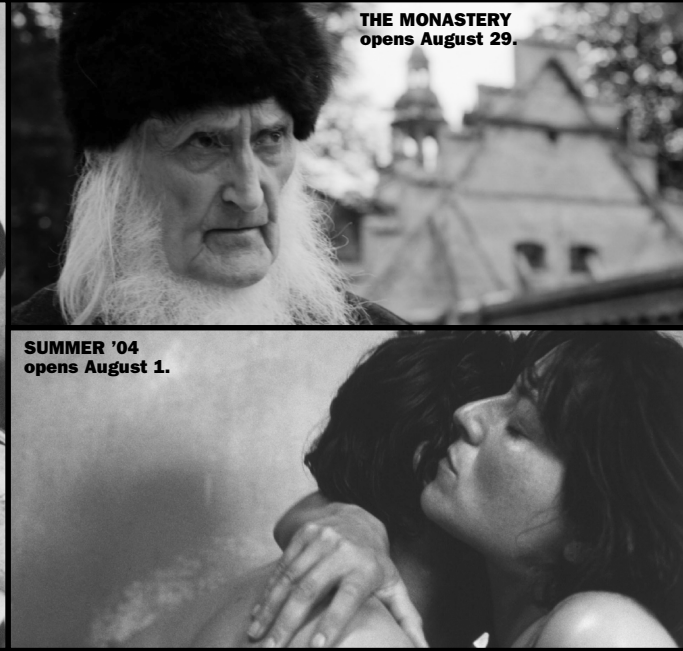
THE MONASTERY opens August 29.