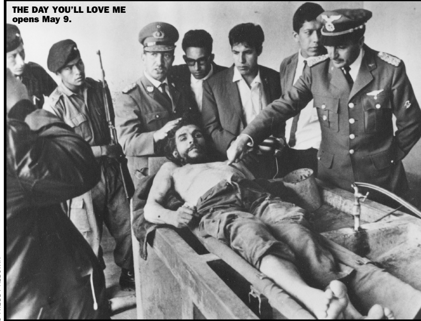
THE DAY YOU'LL LOVE ME opens May 9.