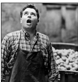
THE MARRIAGE OF MARIA BRAUN