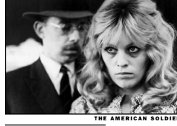
THE AMERICAN SOLDIER

DESPAIR (1979) Despair - Eine Reise ins Licht. In 1930's Berlin, alienated chocolate Dirk Bogarde, finding wife Anouka Ferrel dallying with her ne'er-do-well cousin Volk Spengler, decides to opt out completely by murdering his own Doppelgänger for the insurance money - only trouble is, his "double" bears him no resemblance. Adapted by Tom Stoppard from the Vladimir Nabokov novel, this was one of Fassbinder's three favorites among his works, and "nearly perfect..."