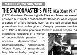
THE STATIONMASTER'S WIFE

LILI MARLEEN NEW 35mm PRINT! (1981) With that legendary title song as her signature, Hanna Schygulla rises to the top of the Third Reich entertainment world, despite Goebbels' hatred for the tune and her romance with Jewish pianist Giancarlo Giannini (later in Swept Away, the original version). Fassbinder's lavish, big-budget recreation of the era created scandal on first release with its cynical depiction of a supposed Jewish underground railway to Swiss freedom, casting Timotheo as his Berlin chief in a typically outrageous touch. "A movie with a fantastic plot and very rich and energetic mise-en-scène..."