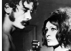
GODS OF THE PLAGUE

GODS OF THE PLAGUE NEW 35mm PRINT! (1969) Götter der Pest. Fresh out of prison, sleazy hood Harry Baer resumes his peristalsis with girlfriend Hanna Schygulla - among others - and crony Gonio (Günther Kaufmann), the two planning a big knock-off of a supermarket for a tour-de-force climax. "A witty, stylish meditation on American Film Noir, filtered through the decidedly dark and morbid sensibility of its director..."