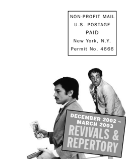
THE MERCHANT OF FOUR SEASONS