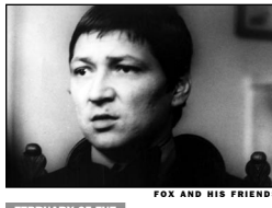
FOX AND HIS FRIENDS