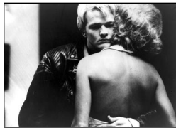
BEWARE OF A HOLY WHORE