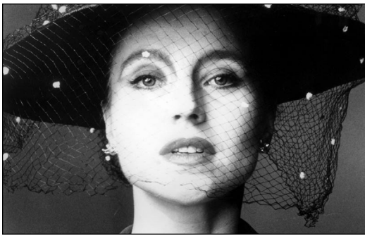
THE MARRIAGE OF MARIA BRAUN