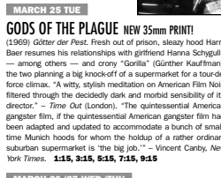
GODS OF THE PLAGUE