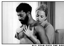
ALL FEAR EATS THE SOUL

ALL FEAR EATS THE SOUL NEW 35mm PRINT! (1974) Angst essen Seele auf. Inspired by Sirk's Lost Heaven Allows and Intimacy of Life, the lumpy love affair between stylish German floorwalker Brigitte Mira and half-Arab, inarticulate Arab mechanic El Hedi Ben Salem: a moving romance, a perverse social comedy, a biting drama of racial prejudice - in Fassbinderland, not always easy to tell where one leaves off and the other begins. Winner, International Critics' Award, Cannes Film Festival. "The most beautiful film of 1974..."