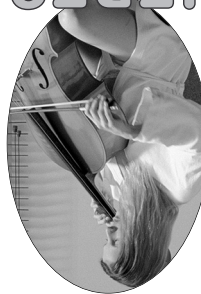
Pere Portabella's THE SILENCE BEFORE BACH opens January 30.

IN ADVANCE! www.filmforum.org TICKETS ONLINE 7 DAYS